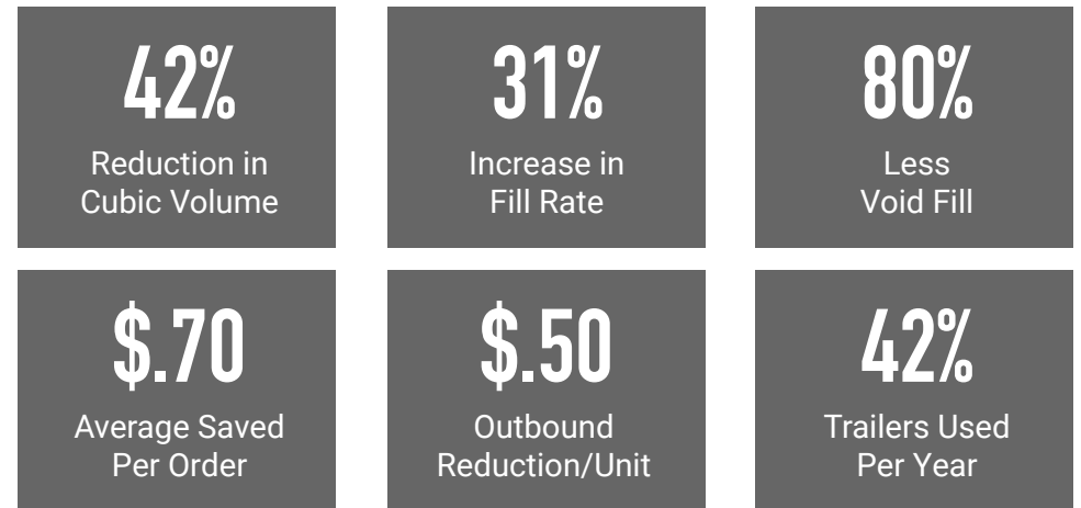
Figure 4. Results from a 20 million parcel audit performed by Packsize.

Right-sizing delivers significant warehouse space savings. And the savings won't stop there. Personnel costs will be radically reduced and consumers will have a significantly better box-opening experience.