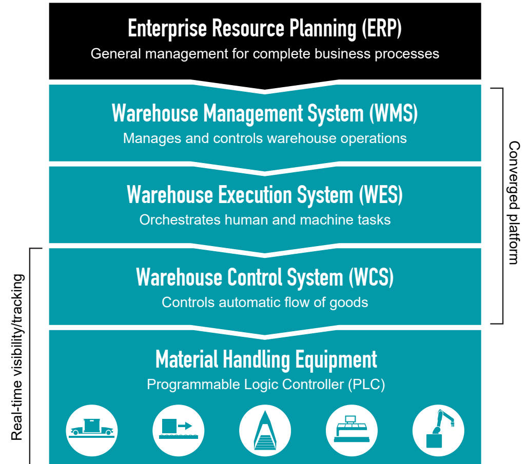
Figure 5. KNAPP's converged platform is engineered for integration of automation software, systems and services